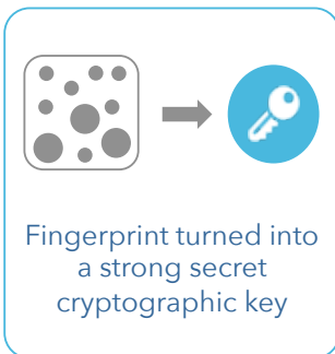
Figure 1: Extracting a strong secret key from SRAM behavior.

Using error correction, SRAM PUF's can be developed that are extremely reliable